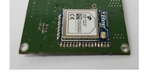
FIG: Microprocessor board bottom view with Zigbee.